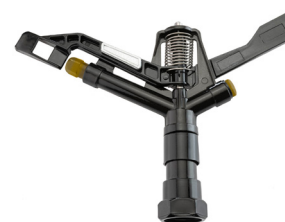
MZ406 with brass nozzle